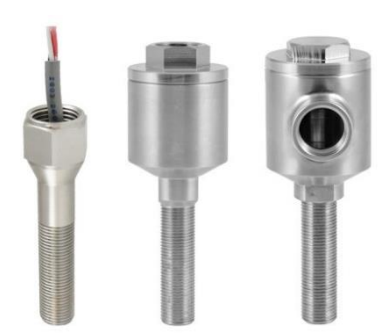
Figure 1: Typical Assembly of the FS Series & ES Series Proximity Switch

This assessment also covers the SPDT ES Series proximity switches. The ES series require external magnetic actuation utilising reed switch technology. These switches are hermetically sealed for use in hazardous locations.